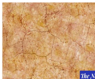
The Nativity by Northcott