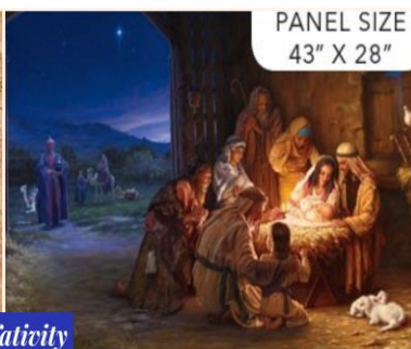
PANEL SIZE 43" X 28"