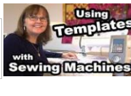
Using Templates with your Sewing Machine $30