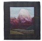
Great White Throne Zion Canyon $25