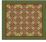
The Real Deal Marie! $50

All Day Friday, March 15th 9:00 AM - 12:00 PM break for lunch then continue from 1:30 PM - 4:30 PM