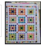
Not Your Granny's Square $25

Kit fee: $75 Kits can be ordered on quiltedwesternviews.com by Feb 1 to allow time for the fabric to be hand dyed. Look for the WAVE fabric kit in the shop. Enter the promo code INCLASS to waive the shipping charge. I will bring the kits to class.