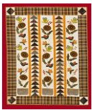
Fly Away $35

Don't you appreciate a class where you learn a technique that can be used in many different quilt variations? So do I. Using the amazing PINEAPPLE RULE , by Possibilities, we will explore a number of ways to create your own version of the old favorite, the Pineapple block. This block lends itself to all sorts of fabric - from friendly reproductions to today's brights or even the new popular solids. Or how about choosing a focus fabric, and adding some zing? But it's also stunning in scraps. (Great way to use up your stash!) There will even be instructions for making a Snail's Trail with this same process. You choose which size block you want to play with, and come prepared with strips cut and ready to stitch. Instructions for pre-cutting will be sent to you prior to class. This promises to become one of your all time favorite techniques.