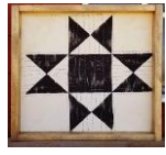
Painted Barn Quilt $25