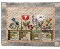
Love Held Love Shared $35

You MIGHT call this class "WHAT?" It's just $0 much fun to see what you can make from a handful of colorful strips and some background fabric. And - biggie here - with this technique you will NOT be cutting off all the edges and leaving a wiggly bias edge on all blocks. It's quick, it lends itself to all sorts of fabrics, it eats up your stash of left over strips. OR it's perfect if you want to choose fabrics that fit your current preference. You're sure to love this technique. Fabric Requirements: TBD - determined by the size block and the finished quilt you desire. We will focus on learning the technique then you can choose which to make. Ideas and fabric requirements will be supplied when you sign up for the class. You may opt to make a bed size quilt, or start with just a small lap or baby size. Your choice.