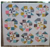
Playful Posies $25

Pattern fee of $6.00 - pattern will be available at class.