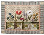
Love Held Love Shared $35

"Love held is the seed ... Love shared is the flower" Mixing regular piecing of log cabins with wool applique brings this charming wall hanging to life. Simple pleasures abound while you learn the techniques for wool applique.