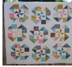
Playful Posies $25