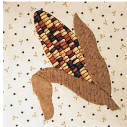
10/22/18 - Halloween