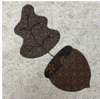
10/15/18 - Oranges