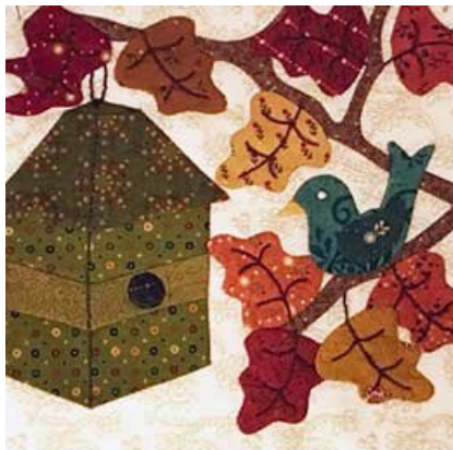
10/8/18 - Teddy