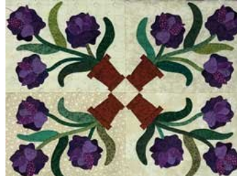
Pots of Flowers