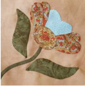
Candace O'keefe's - "Floral 3" This prolific quilter just began appliquéing four years ago.