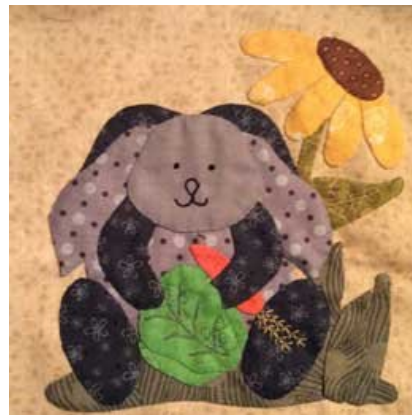
Candace O'Keefe - Sunny Bunny