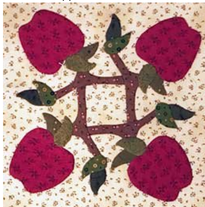
7/16/18 - Apples