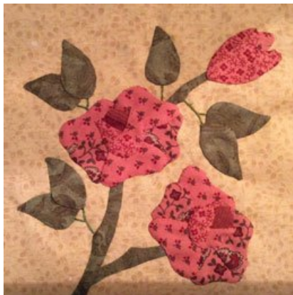
Candace O'Keefe - "Spray of Roses"