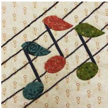
8/27/18 - Musical Notes