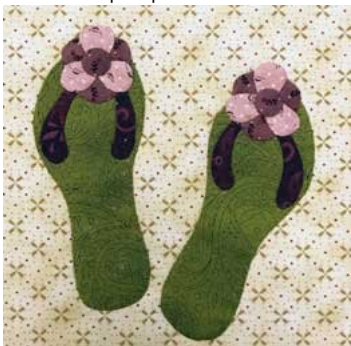
8/20/18 - Flip Flops