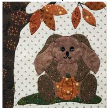
9/3/18 - Harvest Bunny