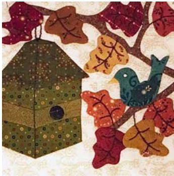
9/17/18 - Autumn Birdhouse