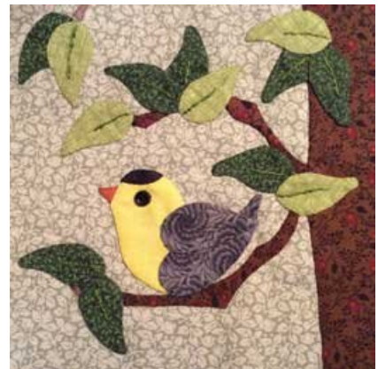
Candace O'Keefe - Songbird