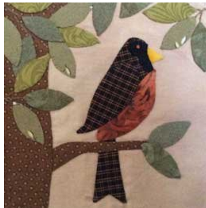
Candace O'Keefe - "Birdie In A Tree"