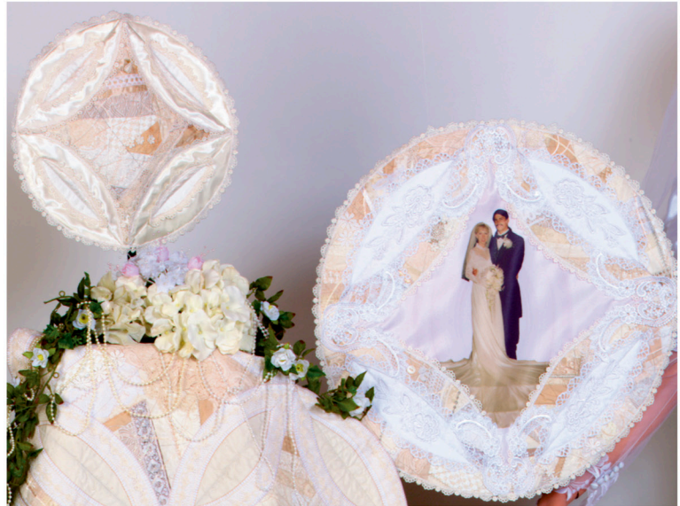
Wedding photo printed on fabric and embellished with lace (wallhanging made with the 15" Arc-Ease tool, ring bearer's pillow made with the 9" tool - see page 56 for ordering information)

stenciling stamping crayon calligraphy dyeing flower pounding