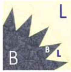
Make 8 blocks