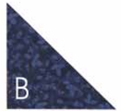
Cut 20 triangles (from five 12 1/2" sq cut twice diagonally)