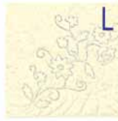
Cut twelve 8 1/2" squares