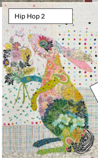
Hip Hop 2