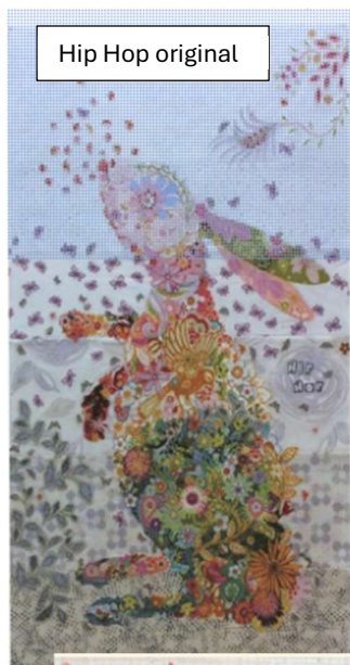
Hip Hop original