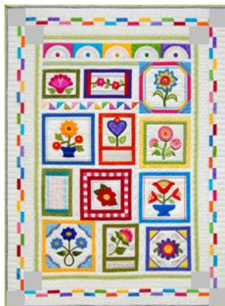
'Stitch Connection' quilt photo

Presser feet, accessories, embellishment items need not be purchased in advance of the first class as these will be discussed more in classes.