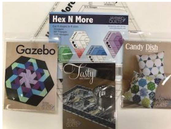
HEX N MORE TEMPLATE & 3 new patterns that use the Hex N More!