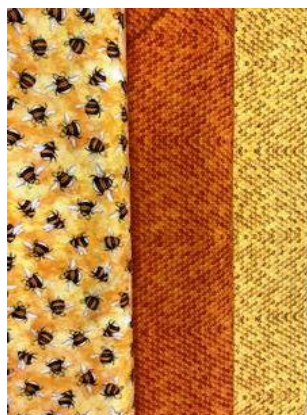
Always Safe Sunshine