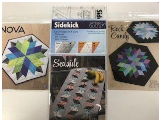
SIDEKICK TEMPLATE & 3 new patterns that use the Sidekick!