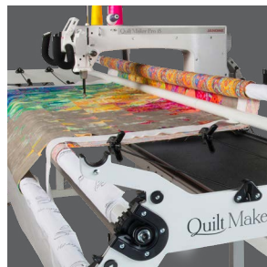
UNIQUE QUILT TOP BAR CONFIGURATION FOR INCREASED RANGE OF MOTION AND VISIBILITY