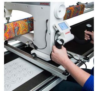
FRONT AND REAR CONTROLS AND ON-BOARD LASER LIGHT FOR USING PANTOGRAPHS