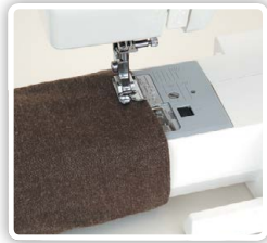
Convertible Free Arm