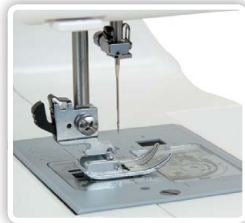
Quick Foot Conversion