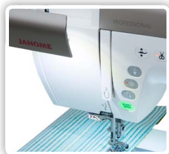
Enhanced (1.6x brighter) full intensity lighting system