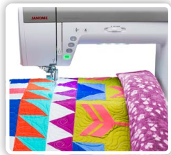
11" Bed Space