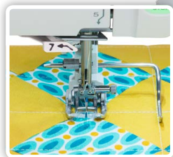
Detachable AcuFeed™ Flex featuring the NEW HP2 foot