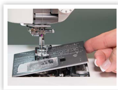
ONE-STEP NEEDLE PLATE CONVERSION