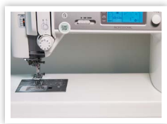
10" ALL METAL SEAMLESS FLATBED