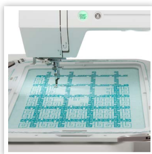
MAXIMUM EMBROIDERY SIZE: 7.9 X 14.2"