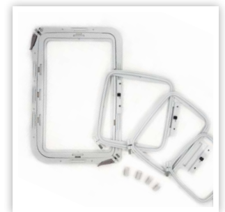
4 STANDARD HOOPS INCLUDED