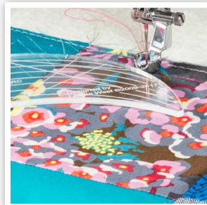
RULER QUILTING FUNCTION