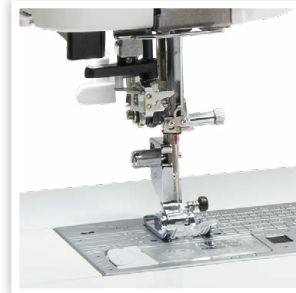
SUPERIOR NEEDLE THREADER AND IMPROVED FIELD VIEW