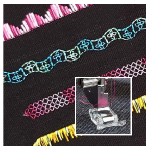
STITCH TAPERING FUNCTION