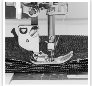
POWERFUL PENETRATION FOR THICK FABRICS