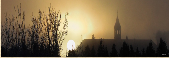
St. Peter's Abbey, Muenster, SK

Imagine being able to knit without interruption? Share the enthusiasm with other knitters be inspired, discover new techniques, get fresh ideas and knit, knit, and knit some more!