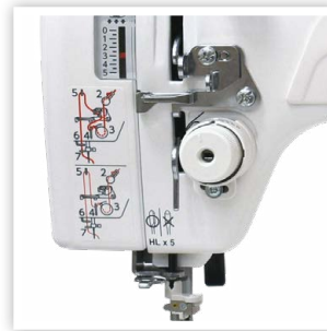
ADJUSTABLE THREAD GUIDE