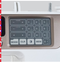
Built-In Accessory Compartment