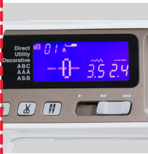
Easy Navigation & LCD Screen