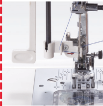
One Hand Needle Threader