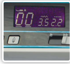
Informative LCD Screen