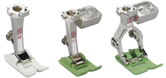
Non-Stick Zigzag Foot #52/52C/52D