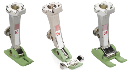
Non-Stick Zipper Foot #53 Non-Stick Zipper Foot with Guide #54 Non-Stick Open Embroidery Foot #56