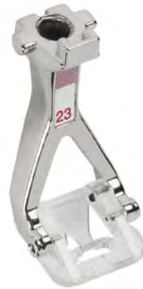
Clear Appliqué Foot #23