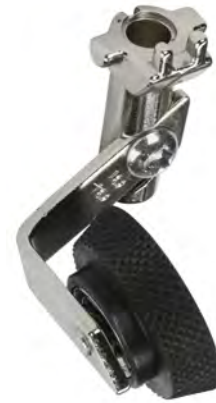
Leather Roller Foot #55