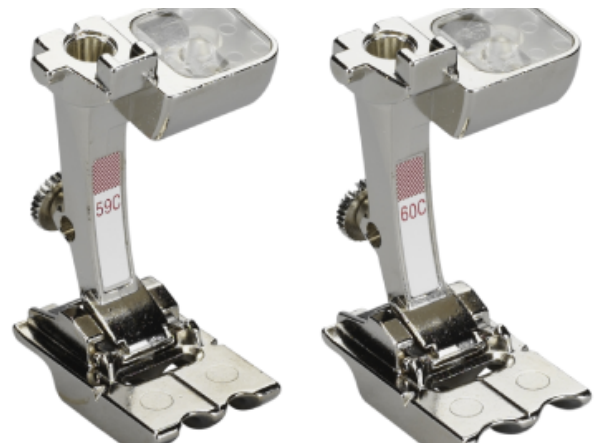
Double Cord Foot #59C Double Cord Foot #60C