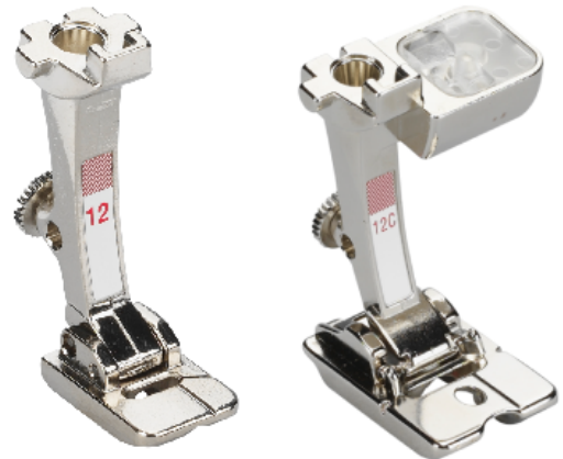
Bulky Overlock Foot #12/12C