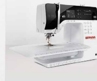
Extension table for a larger work surface

Free download: patterns and project instructions available for download at www.bernina.com/3series .