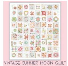
VINTAGE SUMMER MOON QUILT

Cost: $10 registration fee, $32.99/month plus tax