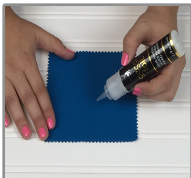
1. Draw, brush or stencil adhesive on fabric.

decofoil™ Liquid Adhesive is a permanent adhesive that can easily be hand drawn or used with stencils to create a one-of-a-kind foil finish. Simply apply, let dry, and foil!