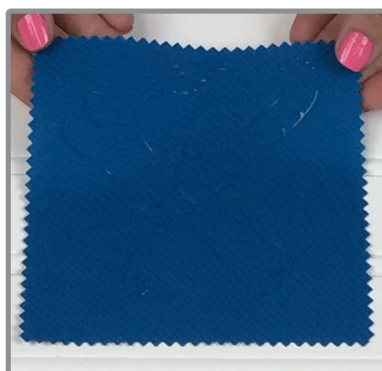
2. Let dry until clear and tacky. (approximately 1-2 hours)