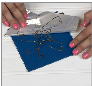
4. Peel back transfer foil.