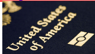
RFID Passport emblem