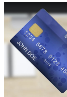
RFID chip on Credit Card and Debit Cards