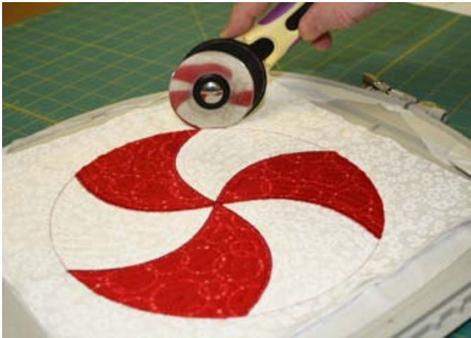
17. Place the hoop on a cutting mat and carefully cut the stitched mat from the hoop through all of the layers with a rotary cutter. Cut just to the outside of the stitched circle outline, being careful to leave all stitching intact.