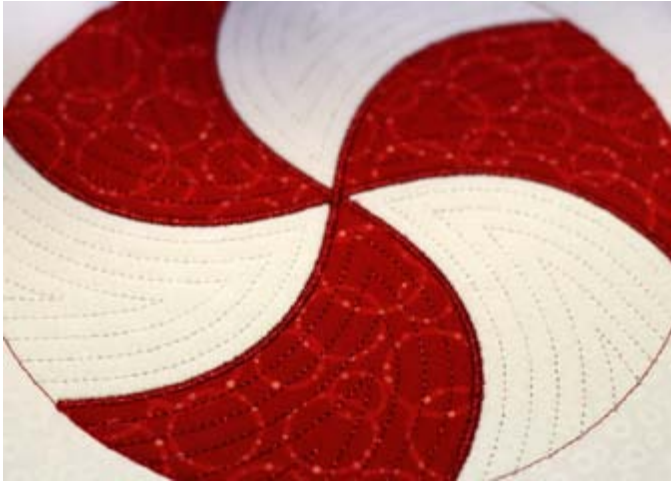
16. The stitching is finished.