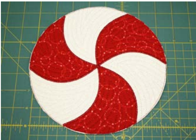
18. We feel the mats look much more professionally finished when bound with bias binding. A satin stitched edge is not very neat looking and the binding is worth the extra bit of effort.