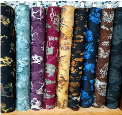
New Batik collection. Bears, elk, trees, paw prints.