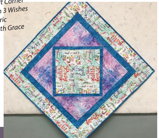
Table Square by The Quilt Corner Fabrics from 3 Wishes Fabric Bloom with Grace

Follow us on Facebook Check us out on Instagram E-Mail www.thequiltcorner.biz