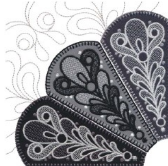
12652-03 Feather Dresden Appliqué 5.09 X 5.08 in. 129.29 X 129.03 mm 26,450 St.