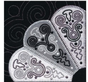
12652-04 Chic Dresden Appliqué 5.10 X 5.09 in. 129.54 X 129.29 mm 21,117 St.