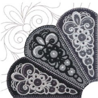
12652-05 Lace Dresden Appliqué 5.07 X 5.06 in. 128.78 X 128.52 mm 33,046 St.