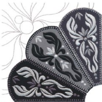
12652-09 Satin Dresden Appliqué 5.08 X 5.08 in. 129.03 X 129.03 mm 18,690 St.