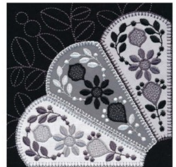
12652-08 Folk Dresden Appliqué 5.08 X 5.07 in. 129.03 X 128.78 mm 19,149 St.