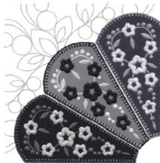
12652-07 Floral Dresden Appliqué 5.08 X 5.08 in. 129.03 X 129.03 mm 19,498 St.