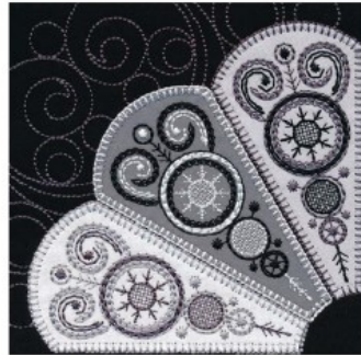
12652-02 Modern Dresden Appliqué 5.07 X 5.07 in. 128.78 X 128.78 mm 17,800 St.