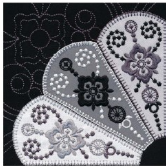
12652-06 Heirloom Dresden Appliqué 5.08 X 5.08 in. 129.03 X 129.03 mm 19,415 St.