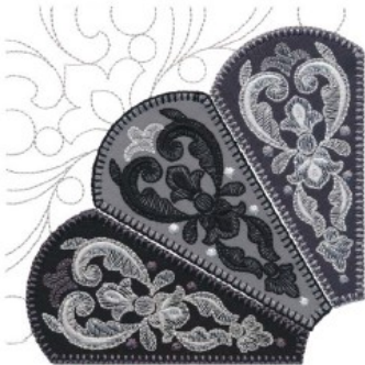
12652-01 Damask Dresden Appliqué 5.08 X 5.07 in. 129.03 X 128.78 mm 23,487 St.

Note: Some designs in this collection may have been created using unique special stitches and/or techniques. To preserve design integrity when rescaling or rotating designs in your software, always rescale or rotate designs using the handles directly on-screen.