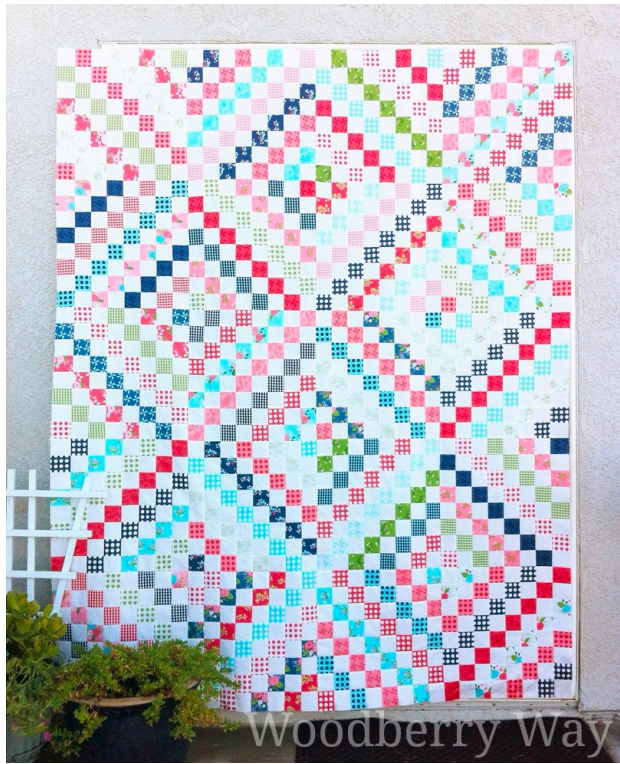
Layout Examples: Prints + Background