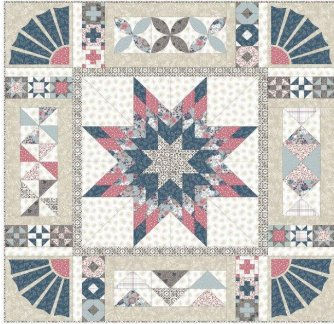
Finished Quilt Size: 88 1/2" x 88 1/2"