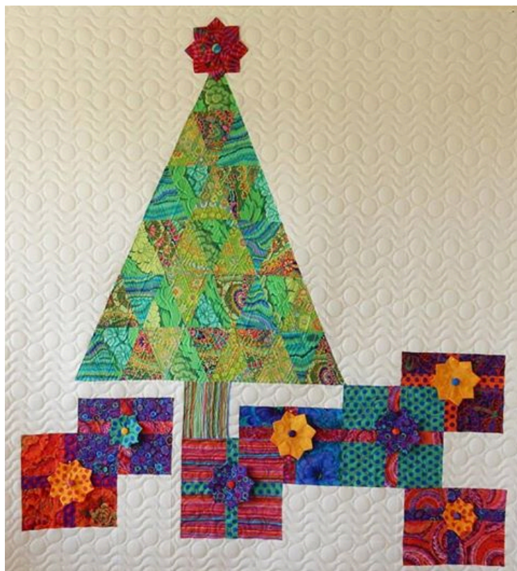
Figure 2: Completed quilt and bow placement.

By Maragret Leuwen of Miss Marker's Quilts