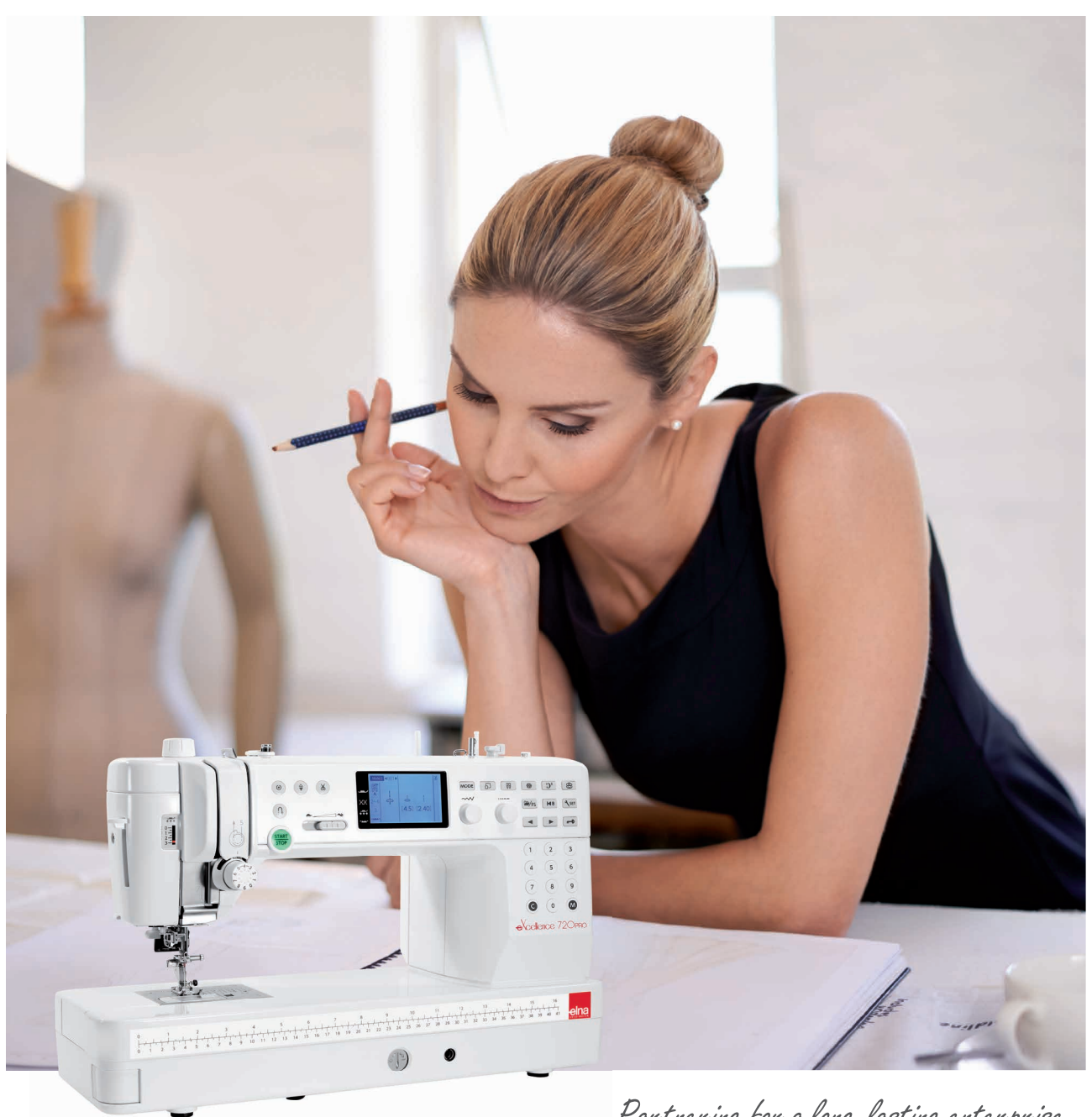
Partnering for a long-lasting enterprise

PROFESSIONAL FLAT-BED COMPUTERIZED SEWING MACHINE