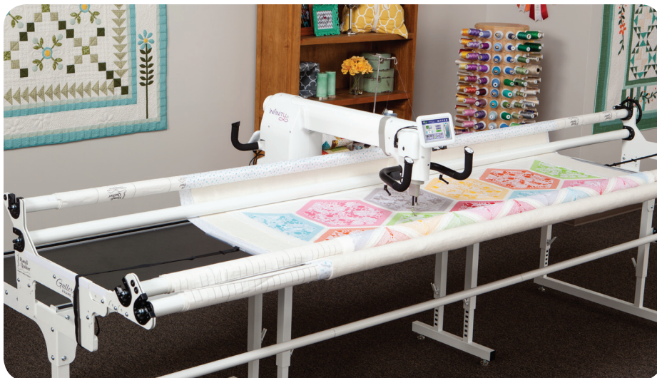
HQ Infinity footprint