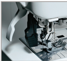
INTEGRATED ADJUSTABLE FEED

Creativity goes wild! Bring a whole new inspiration to the vistas of your imagination. With a panorama of 126 stitches, from the simplest to the most grandiose, your creative nature will flourish. Before your very eyes, you'll bring to life the embroidery and quilt designs you've always dreamed of. In just a few minutes, you'll see an arabesque take shape, a festoon develop or a design motif begin to blossom. Whether it's a simple detail or a sophisticated creation, the eXcellence 720 is naturally gifted to explore with you all kinds of new and unknown possibilities... you'll see your wildest creativity flourish.