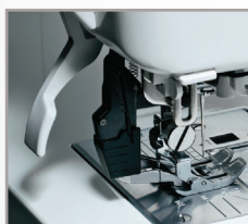
INTEGRATED ADJUSTABLE FEED

Creativity goes wild! Bring a whole new inspiration to the vistas of your imagination. With a panorama of 126 stitches, from the simplest to the most grandiose, your creative nature will flourish. Before your very eyes, you'll bring to life the embroidery and quilt designs you've always dreamed of. In just a few minutes, you'll see an arabesque take shape, a festoon develop or a design motif begin to blossom. Whether it's a simple detail or a sophisticated creation, the eXcellence 720 is naturally gifted to explore with you all kinds of new and unknown possibilities... you'll see your wildest creativity flourish.