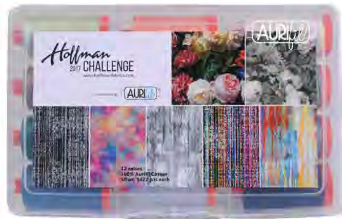
Aurifil's Mastery thread box: SKU#HF5017HC12.

1st: $500 plus $250 of Aurifil Products 2nd: $300 plus $150 of Aurifil Products 3rd: $150 plus $75 of Aurifil Products Honorable Mention: Hoffman Fabric Award People's Choice: Hoffman Fabric Award Best Hand Workmanship (quilts only): $300 Best Machine Workmanship (quilts only): $300