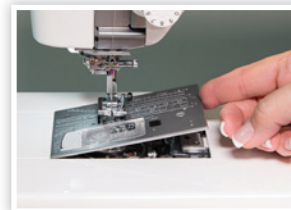
ONE-STEP NEEDLE PLATE CONVERSION