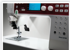
STREAMLINED SHAPE AND ENHANCED LIGHTING