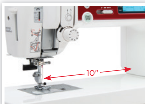
10" ALL METAL SEAMLESS FLATBED