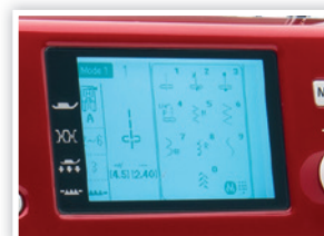
3.6" LCD SCREEN