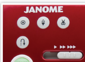
AUTOMATIC THREAD CUTTER