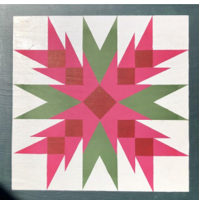
BQ1008 Christmas Cactus