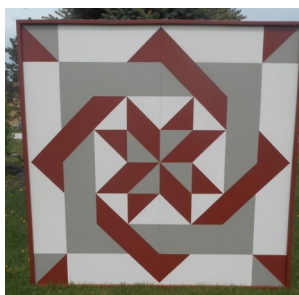
BQ1007 Interlocking Star