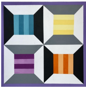
BQ1003 Thread Spools