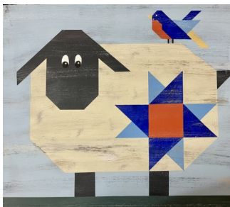
BQ1011 Tweet Sheep