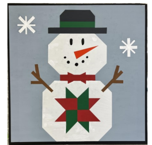
BQ1010 Happy Snowman