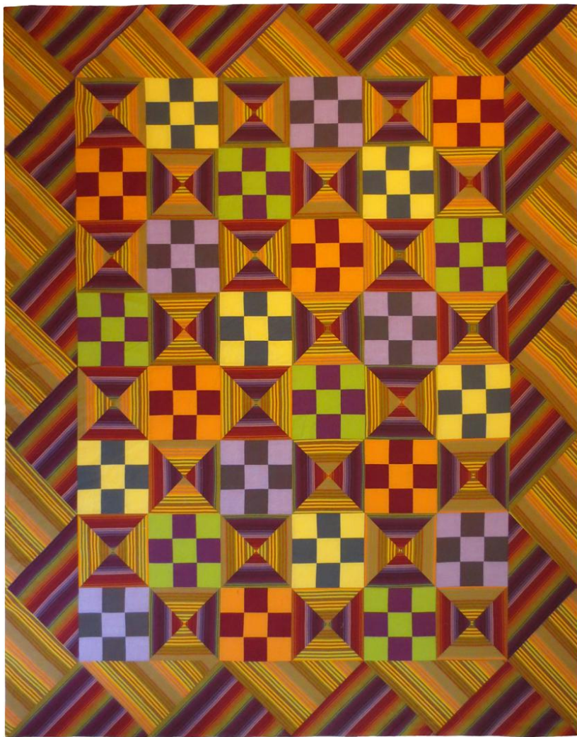
Quilt: 72" x 90" (generous twin) Block 9" Border 9"