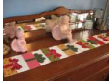
Presents a Plenty