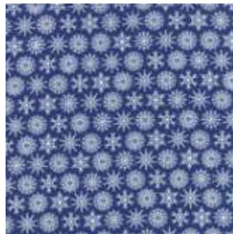
Folk Art Holiday