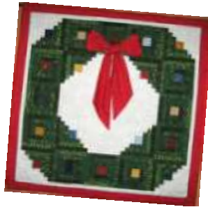
Home for Christmas

If you are wanting something new for the fall and Christmas seasons, now is the time to shop. Here are some patterns to help inspire you.