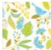
Wing & Leaf

There's a lot of new fabric too. It seemed like the UPS truck was coming every day. I even had to buy another bookcase to have room for all the new bolts.