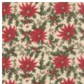
Under the Mistletoe