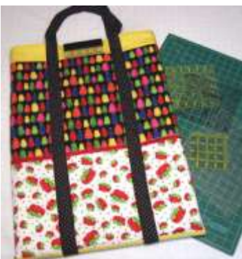
Mat & Ruler Bag