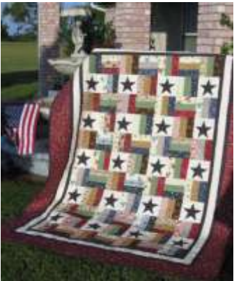
Stars and Stripes - A Jelly Roll Pattern