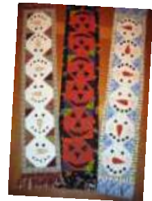
Snowball the Snowman