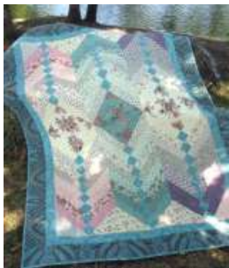
Jelly Roll French Braid