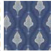
Grand Traverse Bay