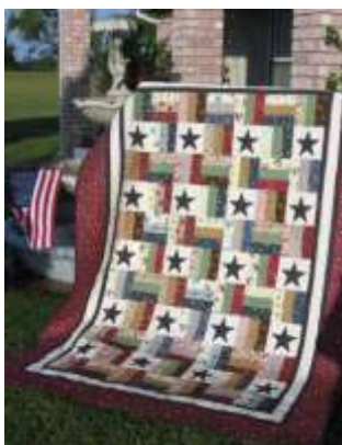
Stars and Stripes - A Jelly Roll Pattern