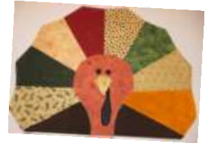
Gobble Gobble Turkey Placemat pattern