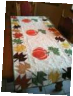
Joys of Fall Bed Runner Table Runner Pattern

You may want to check out my fabric too. There are some great buys on holiday fabric.