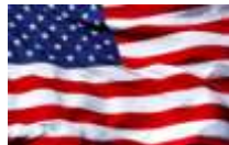
Veteran's Day, Wednesday, 11/11/15