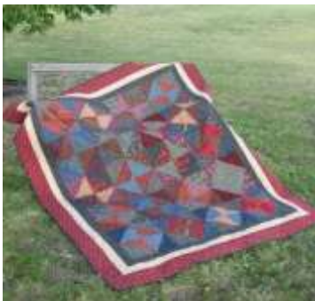
Jubilee - A Layer Cake pattern.

Jelly Roll French Braid pattern is also available.