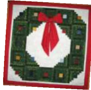
Home for Christmas pattern