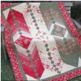
A New Twist - Layer Cake French Braid.

Jelly Roll French Braid pattern is also available.