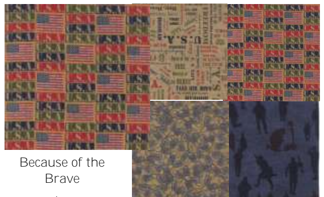
Because of the Brave by Moda