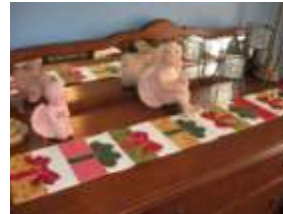
Presents a Plenty