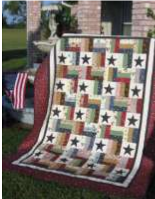
Stars and Stripes - A Jell Roll Pattern