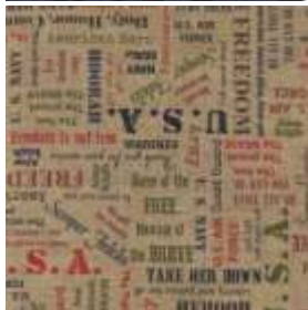
Because of the Brave Fabric