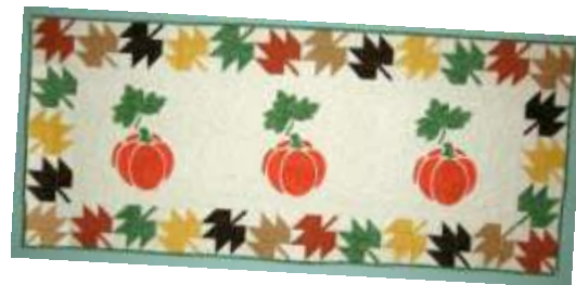
Joys of Fall