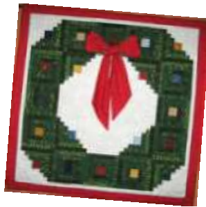
Home for Christmas

If you are wanting something new for the fall and Christmas seasons, now is the time to shop. Here are some patterns to help inspire you.