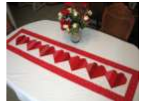
Be My Valentine

Do you decorate for Valentine's Day? I have a couple of quick projects you still have plenty of time to complete.