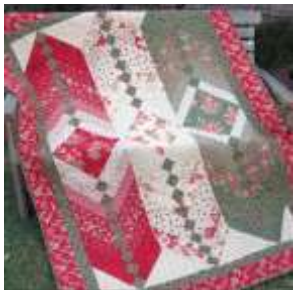
A New Twist-Layer Cake French Braid