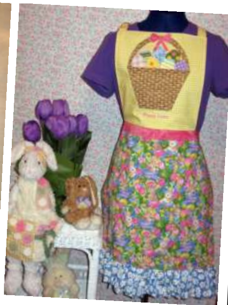
Happy Easter Bib Apron