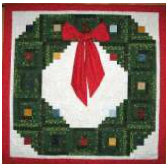
Home for Christmas - Log Cabin Wreath