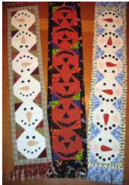
Snowball Wall Hanging/ Table Runner