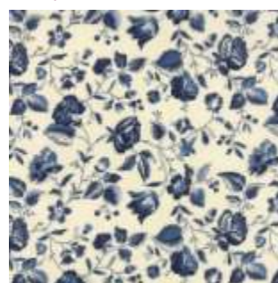
Lexington