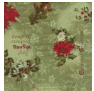
Winterlude by 3 Sisters