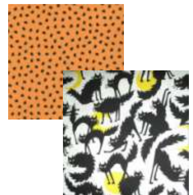
Don't forget Halloween!