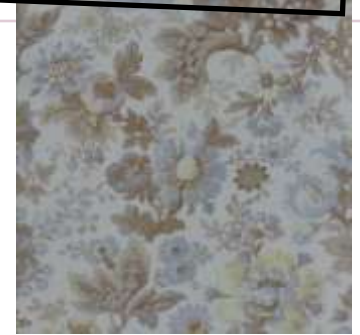
Snowbird by Laundry Basket Quilts