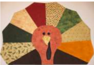
Gobble Gobble - Turkey Placemat