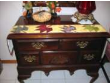
Falling Leaves Mini Table Runner