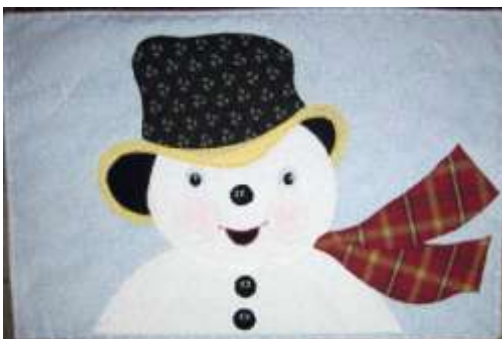
Frosty the Snowman Placemat