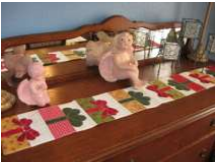
Presents a Plenty Mini Wall Hanging/ Table Runner