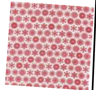
Folk Art Holiday