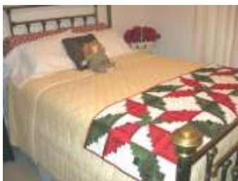
Poinsettia Bed Runner/ Table Runner