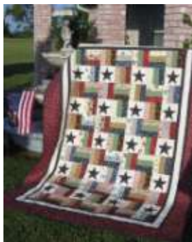
Stars and Stripes