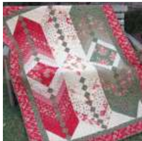
A New Twist-Layer Cake French Braid