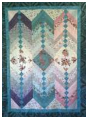
Jelly Roll French Braid

I think Spring has finally arrived here in North Texas. It was a hard winter for all of us in North America though.